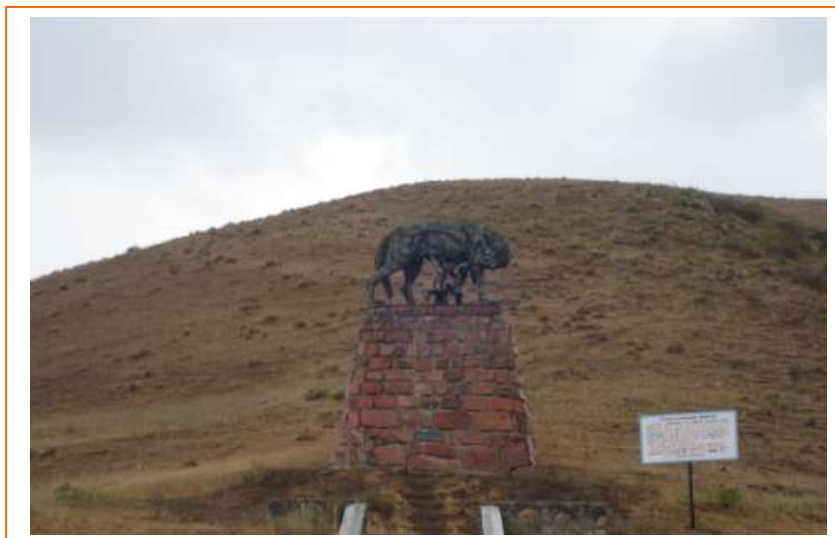
Shahrستان district, Sughd oblast: archaeological find (She-wolf feeding two boys)

Full Name: Republic of Tajikistan Capital City: Dushanbe Territory: 143,100 sq km \approx 55,251 sq miles Population: over 7 mln Time Zone: GMT +5 Languages: Tajik (official), Russian (international communication) Religion: Sunni Muslim (80%), Shi'a Muslim, other Currency: Tajik Somoni (TJS) Electricity: 220V 50Hz